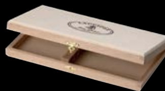
5396S099 Beechwood Presentation Box 26.0 x 14.0 x 3.5cm (10¼" x 5½" x 1½")