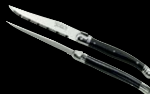
5392S057 Black Handle Steak Knife with Serrated 1.2mm S/S Blade

Steelite International introduces the Laguiole steak knife collection. Each Laguiole knife is subjected to a special firing process, providing ultimate blade flexibility and a long lasting, perfect cut.