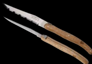
5391S057 Oak Handle Steak Knife with Serrated 1.2mm S/S Blade