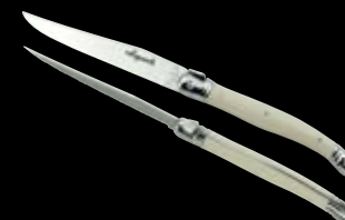
5393S057 Ivory Handle Steak Knife with Serrated 1.2mm S/S Blade