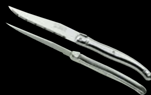
5390S057 Steak Knife with Serrated 1.2mm S/S Blade