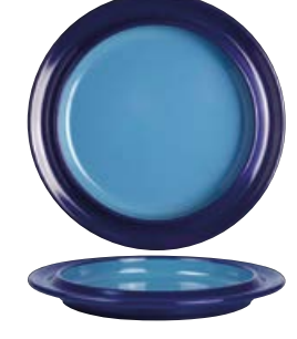
EL677 25.0cm (10")