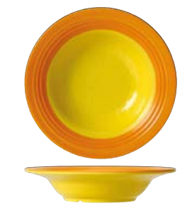
EL669 20.3cm (8")