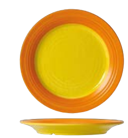
EL668 23.0cm (9")